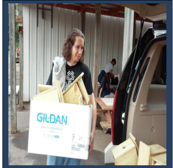
FCCCA youth member loading birdhouses.